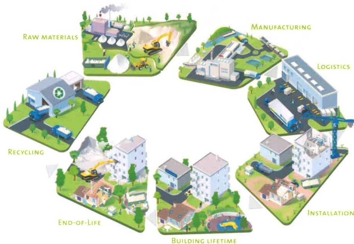
Flow diagram of the Life Cycle