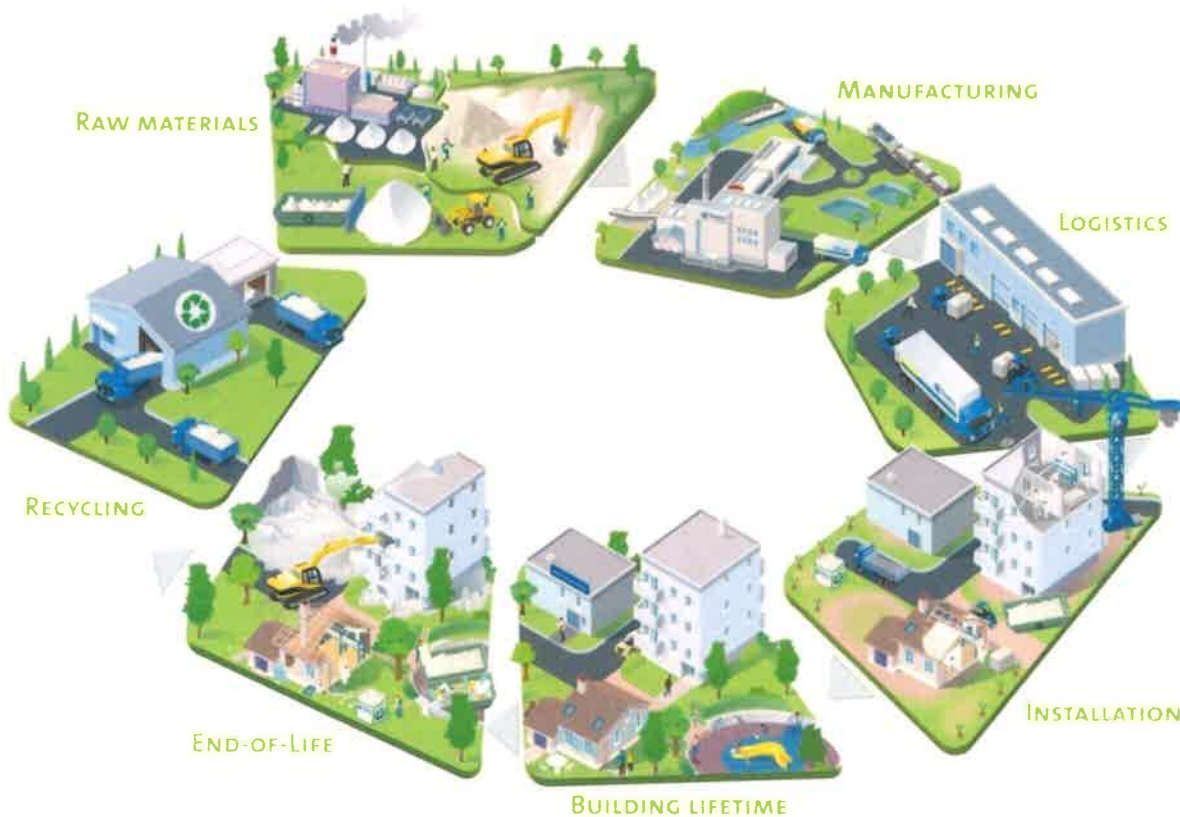
Flow diagram of the Life Cycle